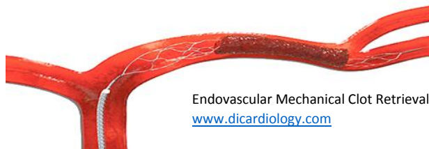
Endovascular Mechanical Clot Retrieval

EVT consists of arterial catheterization and mechanical removal of large clots occluding a vessel in the brain thus directly promoting reperfusion by recanalization of the artery. This treatment is provided with or without IV tPA. EVT involves a catheter and retrievable stent being inserted into the femoral artery through to the intracranial occlusion. The clot is then pulled out via the retrievable stent device. EVT is an “awake” or conscious sedation procedure performed in the Interventional Radiology (IVR) suite.