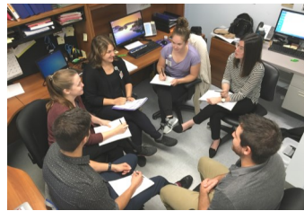
GMH team during their RI Huddle Examples of these strategies include:

identified 90 min/day as an incremental step towards achieving the provincial target of 180 min/day. When a patient's RI is not meeting this incremental goal, the team identifies ways to increase intensity.