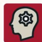
REPS recovery Exercises