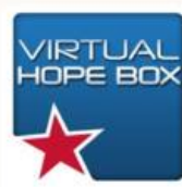
Virtual Hope Box