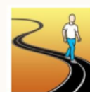
Lingraphica TalkPath Therapy