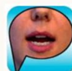
Oro motor - small talk

For additional app suggestions, please go to https://www.my-therappy.co.uk/apps/stroke-brain-injury